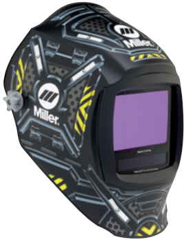
Black Ops™ 296779