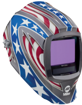
Stars and Stripes™ 296780