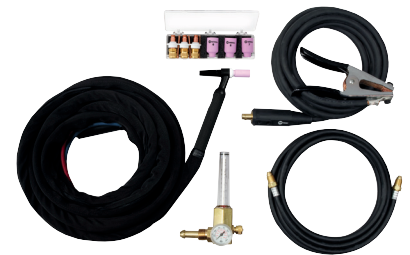
301268 kit shown.