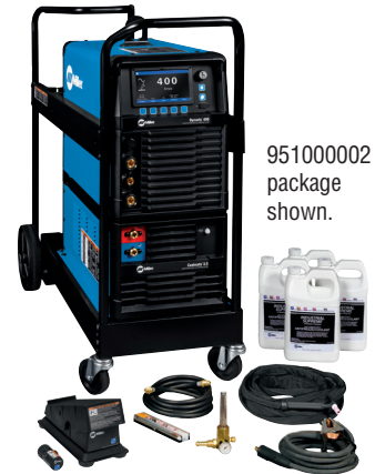
951000002 package shown.