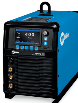
Dynasty 400 machine only

Allows for any input voltage hookup (208–600 V) with no manual linking, providing convenience in any job setting. Ideal solution for dirty or unreliable power.