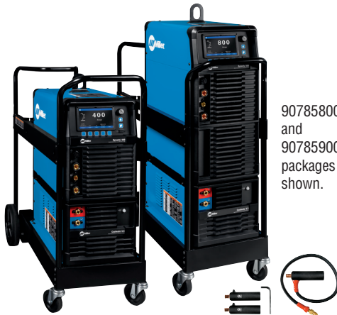
907858001 and 907859001 packages shown.