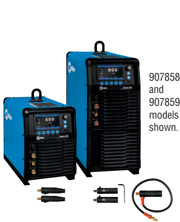
907858 and 907859 models shown.

Order machine only or use a single stock number to order a complete preconfigured system.