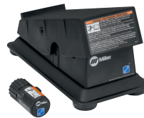
301580 remote shown.