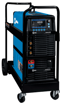
907858001 Dynasty 400 TIGRunner® shown with four bottles of 043810 Low-Conductivity Coolant.

Select desired stock number for each step.