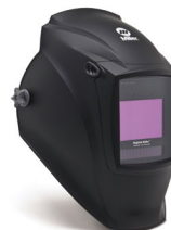
Digital Elite™ 289755