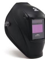
Digital Performance™ 289842