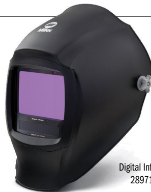
Digital Infinity™ 289714